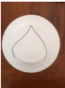
Give to children