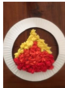
Glue paper balls onto the flame