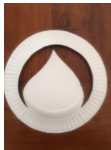
Cut out inner part of plate