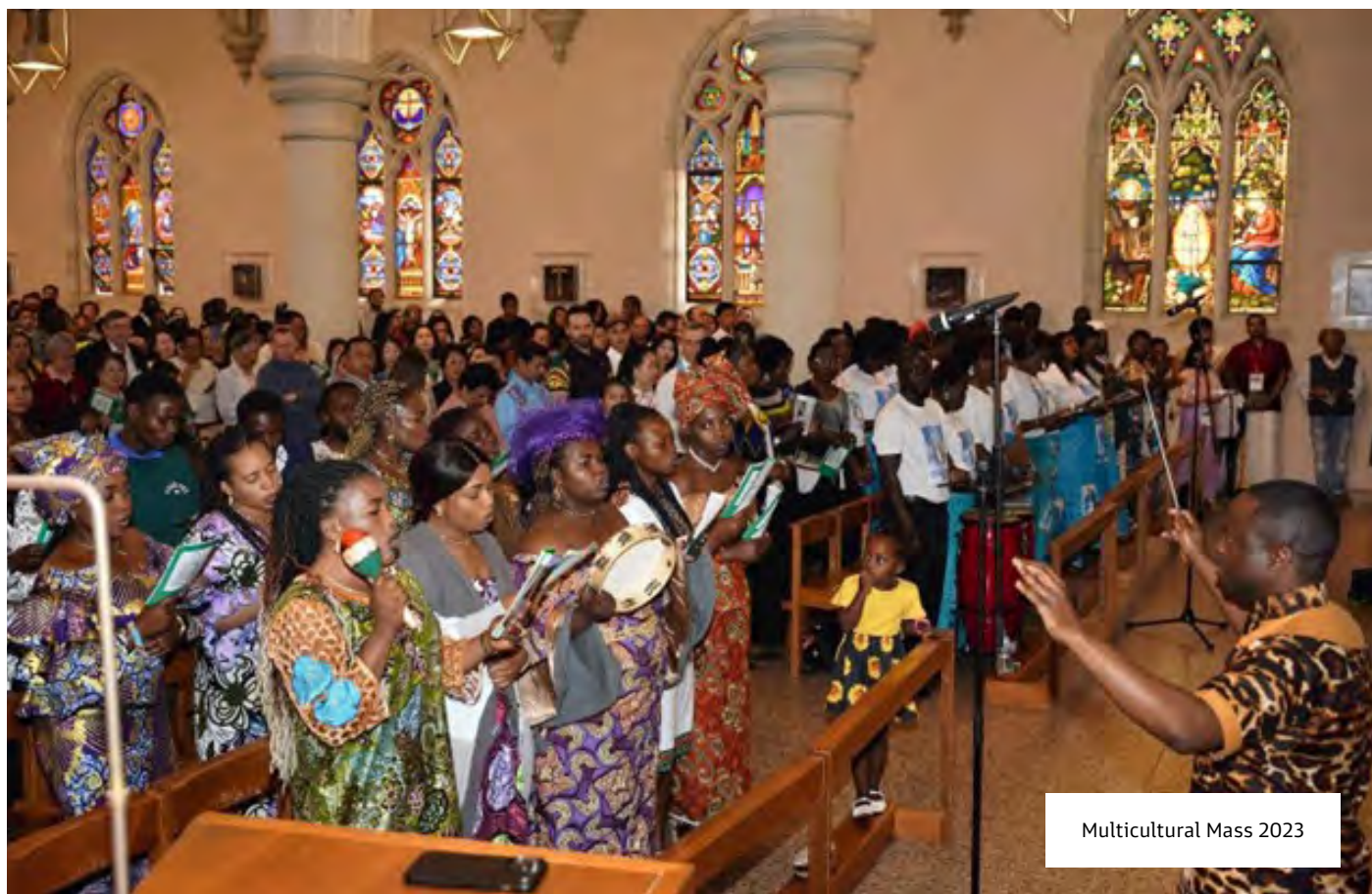
Multicultural Mass 2023

in 2023 and the new RAP (2023–2025) was launched to coincide with the inaugural Archdiocese of Brisbane Reconciliation Dinner (event sold out months in advance).