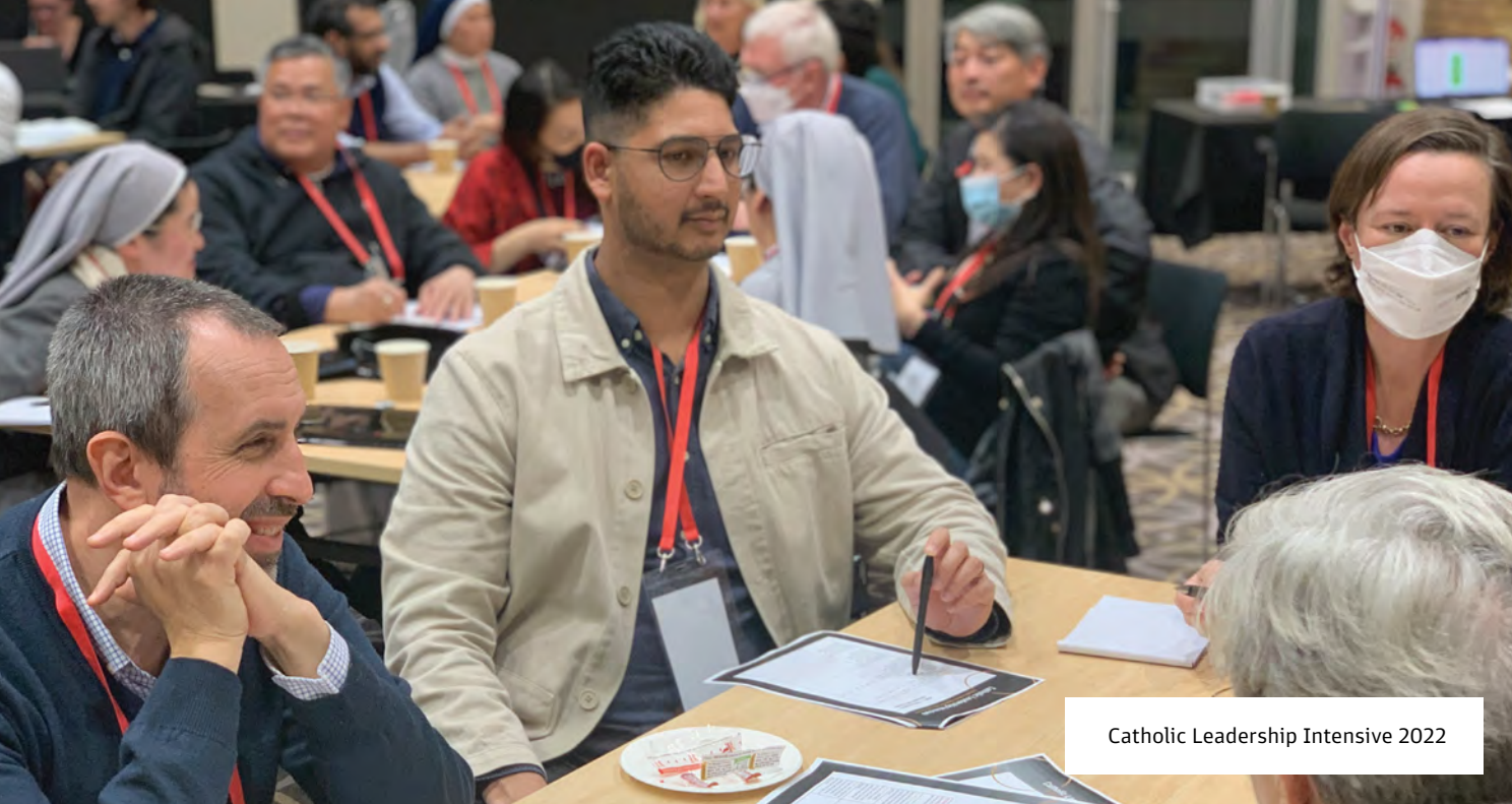
Catholic Leadership Intensive 2022