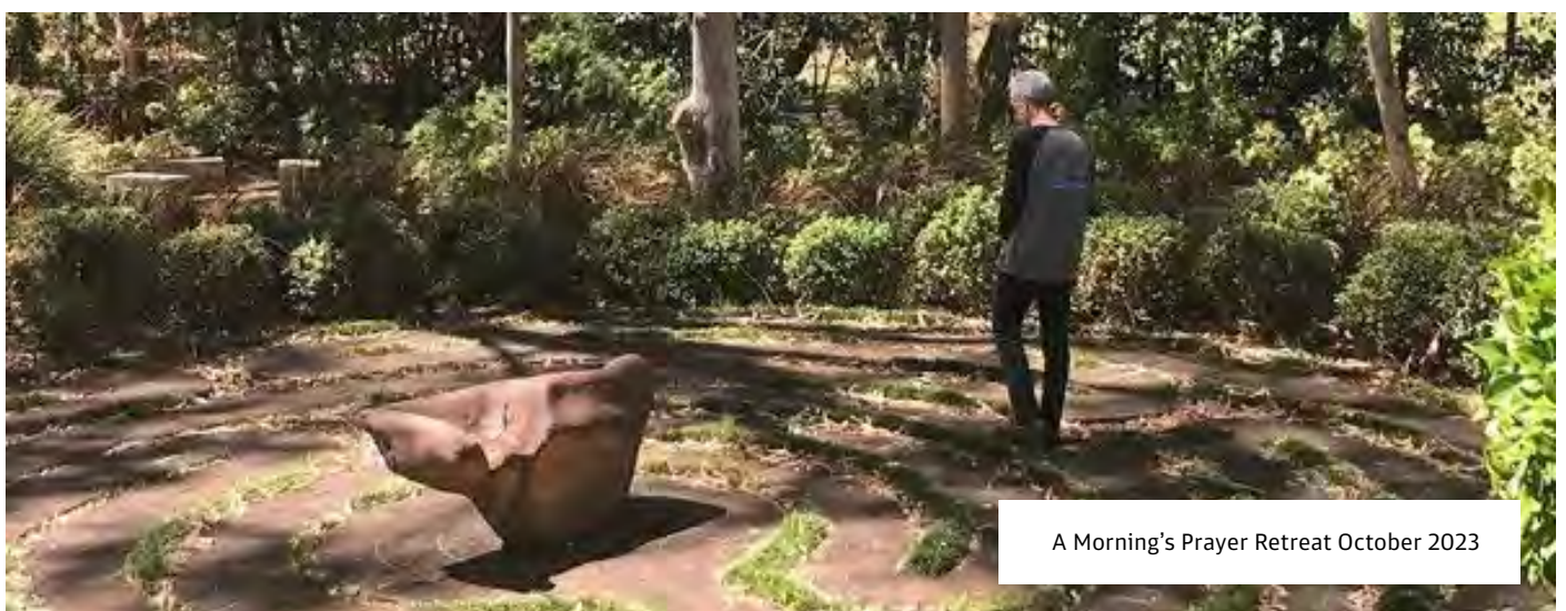
A Morning's Prayer Retreat October 2023

68 Going Deeper podcasts were recorded with 15,561 downloads.