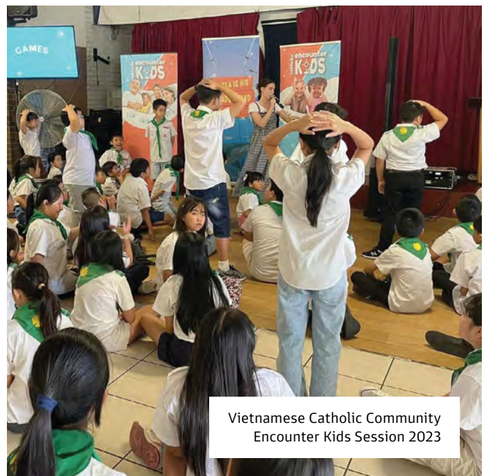
Vietnamese Catholic Community Encounter Kids Session 2023