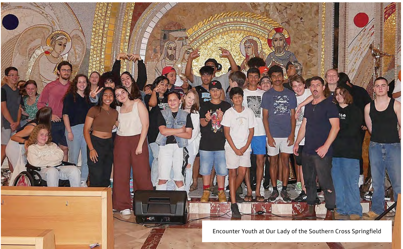
Encounter Youth at Our Lady of the Southern Cross Springfield

“ 100 young people are gathering weekly. ”